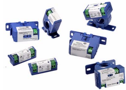
CSD Series Current Device

CSD-CA1G1-1 (split core with 24 V command relay)